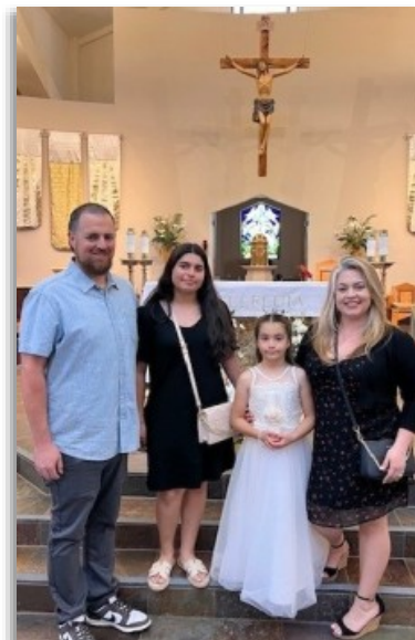
Member of this year's First Holy Communion Class