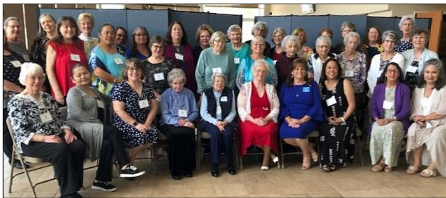
Our Lady of Hope #258, Young Ladies Institute